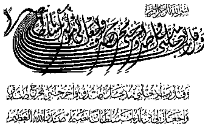
FIGURE 5. Surah 17:80, the two lower lines written above in the form of a ship.

Surah 17:80 - verse that likens the sayer to a captain of a ship who enters and exits truth and that the truth of God is great.