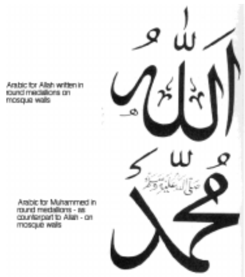
Pg. 170 "Islam from Within"

During the Mughal reign of Shah Jahan, the Taj Mahal was erected in Agra, India. The calligraphic inscriptions and geometric designs were made by