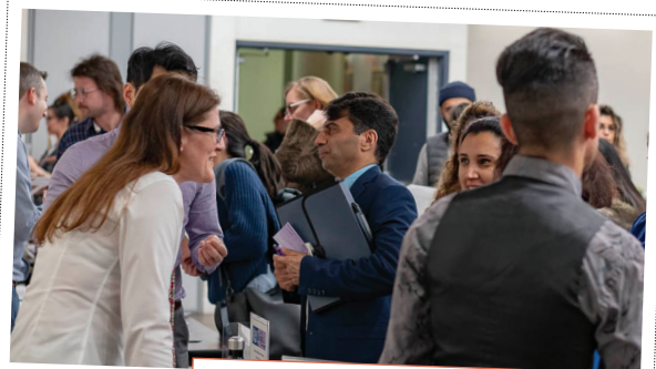
TESL Toronto employment event